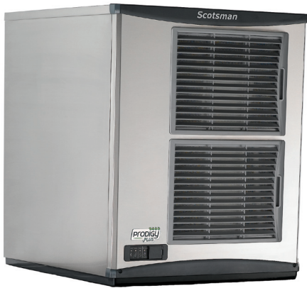
1. Remove front panel

Basic Procedures - see user manual for complete directions.