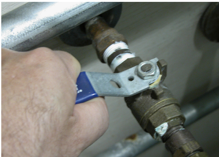
3. Shut off water supply to reservoir.