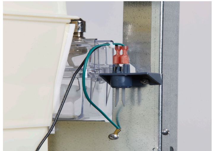
5. Check water sensor.