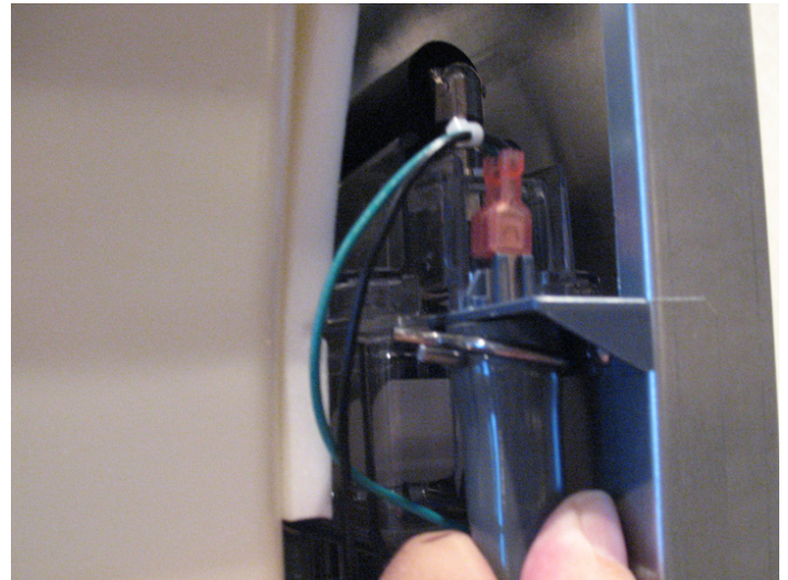
4. Locate drain hose, lower to drain water.