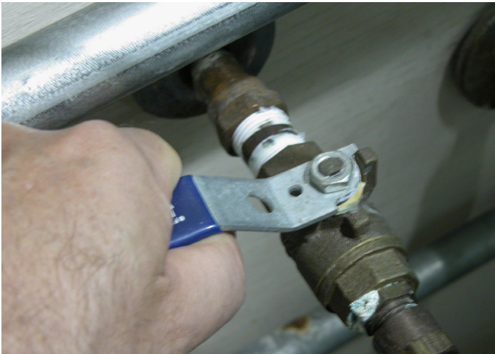
14. Open water valve and remove funnel.