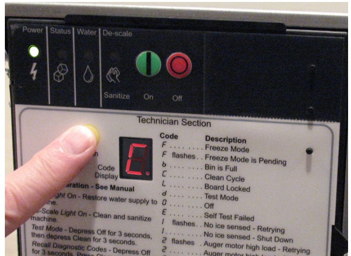
12. Push and release the Clean button.