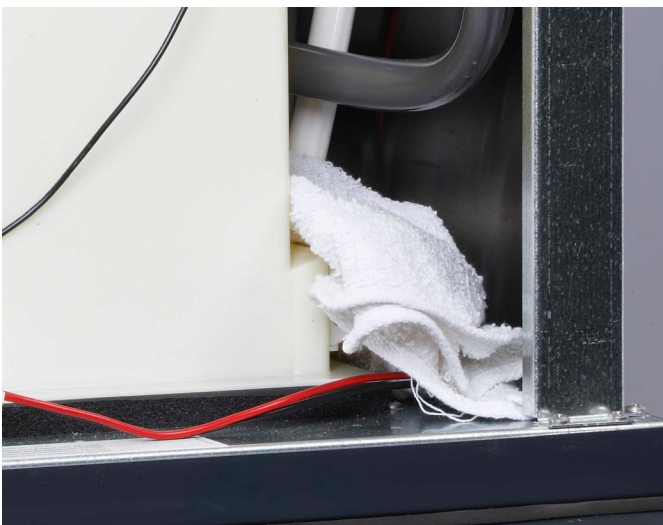
9. Cover photo eyes.