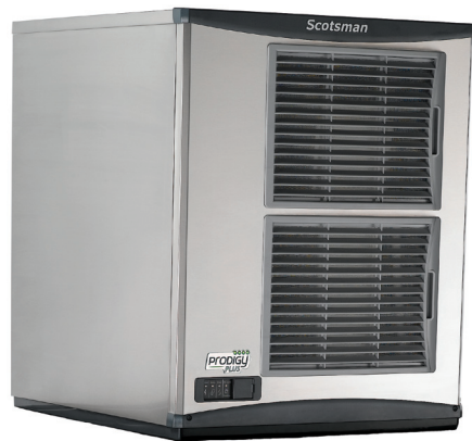
18. Re-attach front panel.