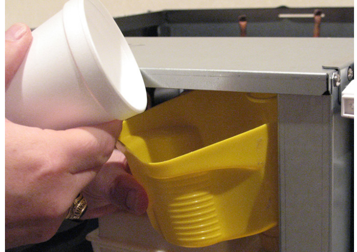
11. Add scale remover solution to reservoir.