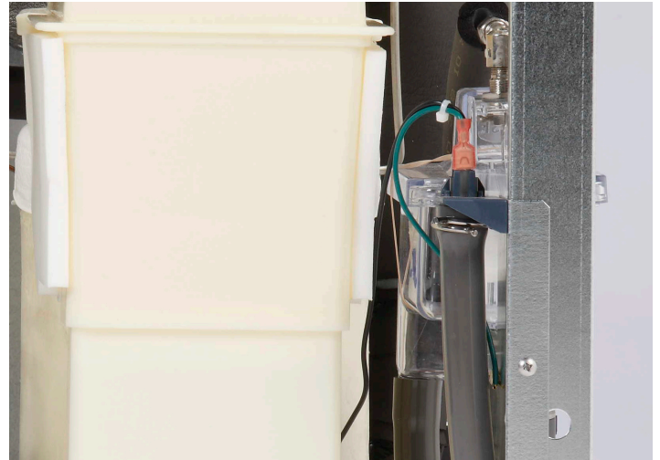
6. Return hose to its original position.