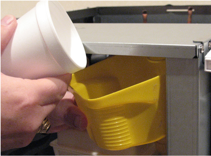
13. After the compressor starts, pour in more solution until it is all used up.

Basic Procedures - see user manual for complete directions.