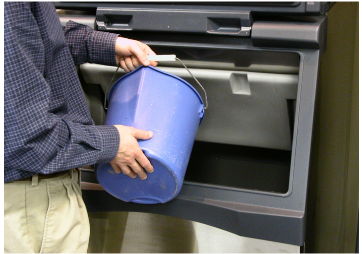
16. Discard or melt any ice made during cleaning.