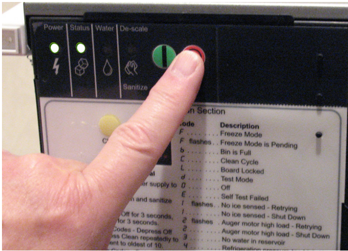
2. Push Off to stop ice making. Discard or catch ice.