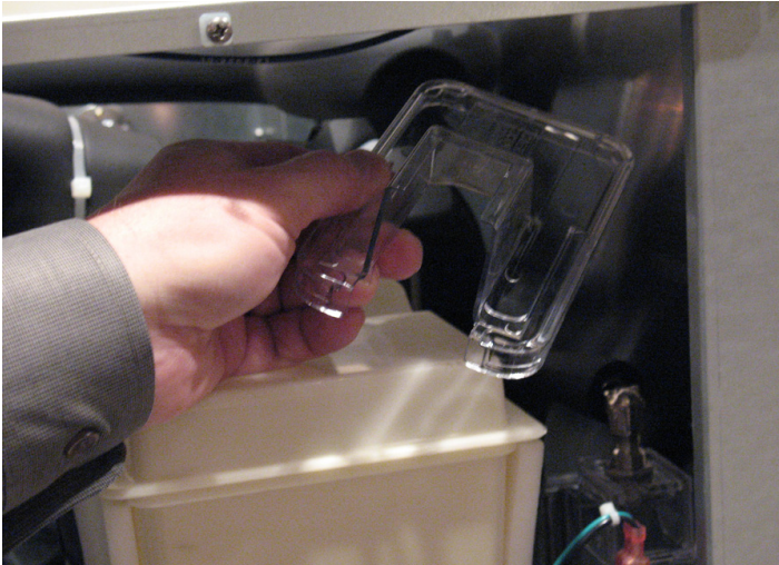
8. Remove reservoir cover.